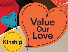
Newcastle and Middlesbrough Kinship Campaigners developing their local campaigns.

Find out more about the campaign and sign the petition at: ValueOurLove.Kinship.org.uk