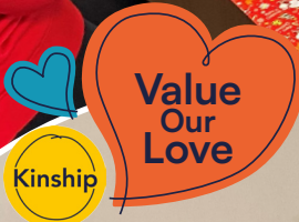
Newcastle and Middlesbrough Kinship Campaigners developing their local campaigns.

Find out more about the campaign and sign the petition at: ValueOurLove.Kinship.org.uk