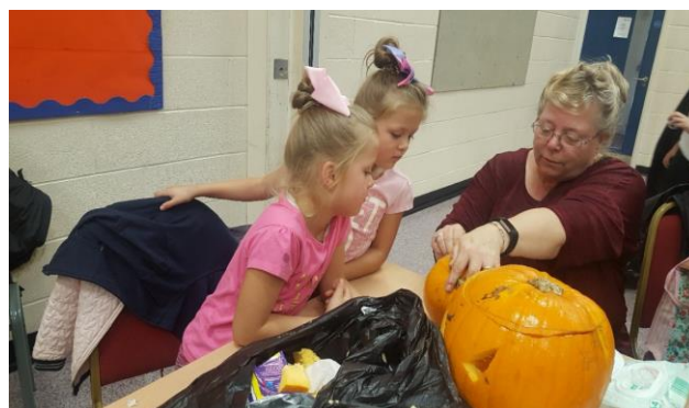
@Kinship Carers Liverpool April 2019