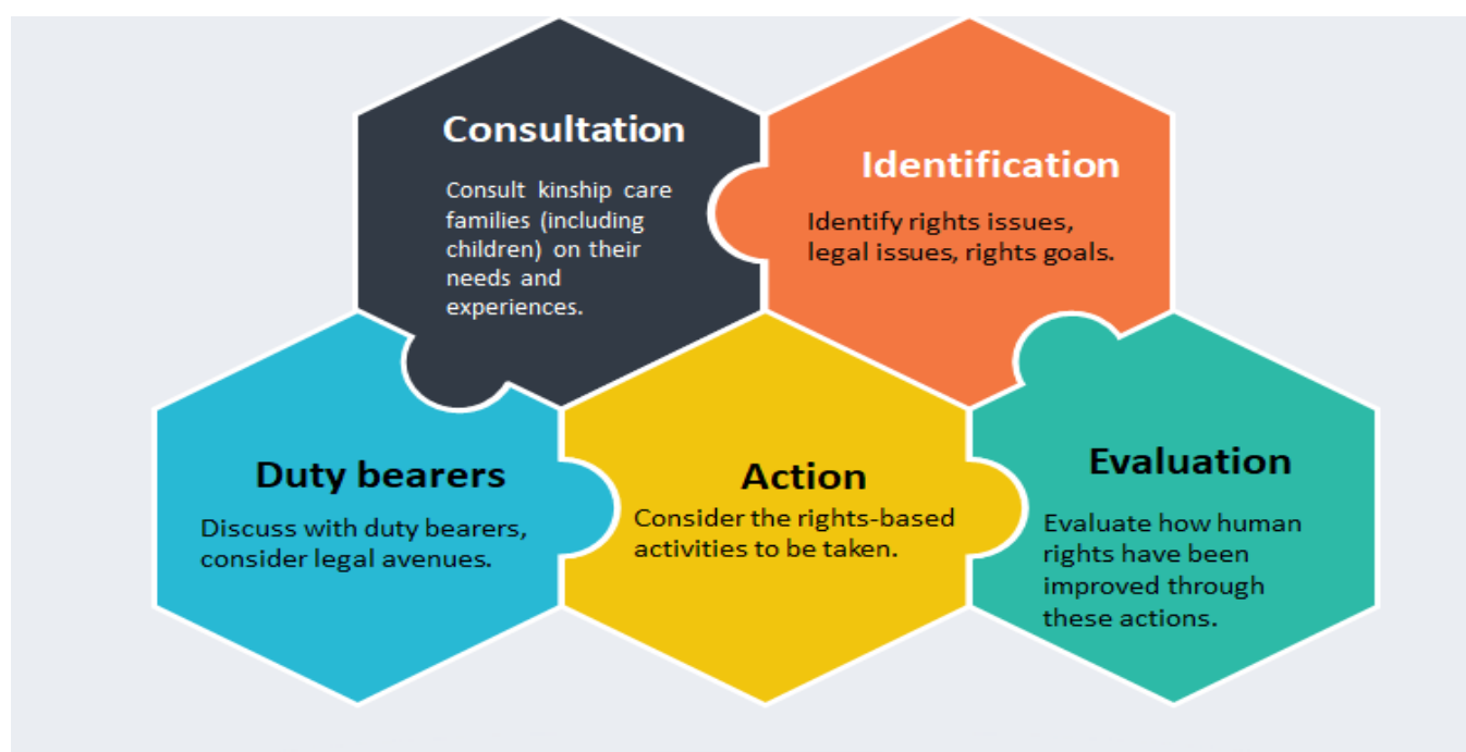
Table 2. Kinship care: Components of a human rights-based approach (Daly, 2019)

In Liverpool, our human rights-based approach focused on the components outlined in Table 2. We adopted five steps in our approach to kinship care: